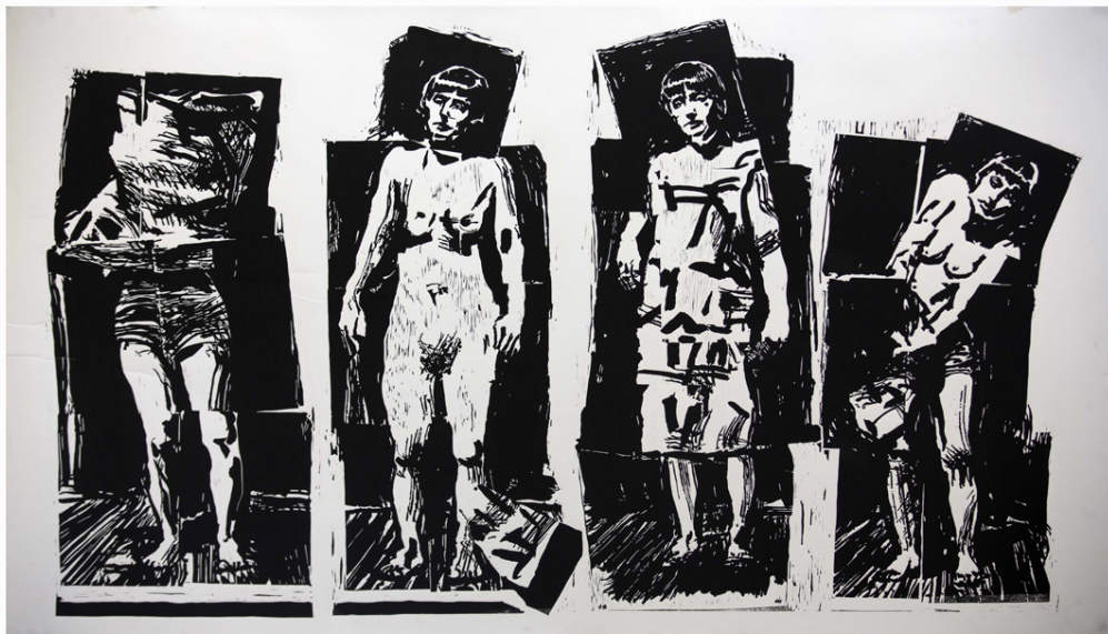
Four Figures 2017 100 x 179 cm Linocut on BFK Reeves Velin 300 gsm by MK and Artist

The works in this exhibition include five large multi-panel lift ground aquatint etchings that echo some of the key images in the installation in Rome. There is a film on view of the memorable processions and the opening in Rome.