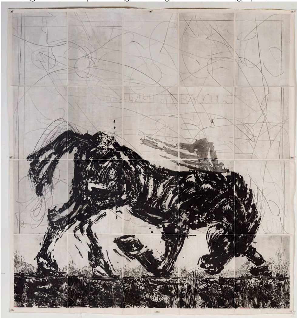
Triumph of Bacchus 2016 164 x 153.5 cm Lift Ground Aquatint etching on 100% Hemp Phumani handmade paper

Original multi – panel large etchings, linocuts, lithographs, film